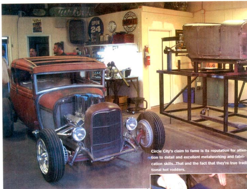
Circle City's claim to fame is its reputation for attention to detail and excellent metalworking and fabrication skills...That and the fact that they're true traditional hot rodders.